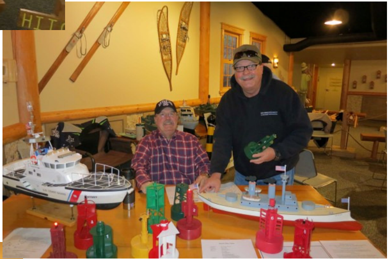
Coasties were on hand to explain (after some debate) which pointee end is the bow and which is the stern.