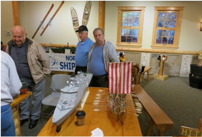
Even the Scandinavians were represented