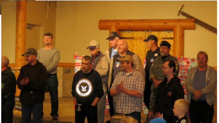
Veteran's were honored as part of the special ceremonies.