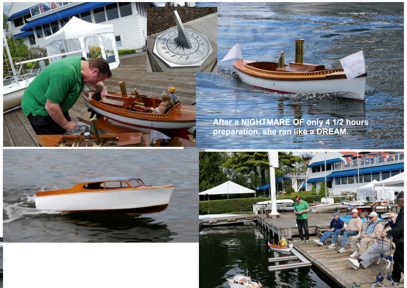
After a NIGHTMARE OF only 4 1/2 hours preparation, she ran like a DREAM.

From the Bridge (cont.) judge is looking for on their part of the course. Oh, also practice backing, a word to the wise. And for those planning to enter boats into the scale judging contest there are two classes: work boats and non-work boats. Work boats are tugs, fishing boats, buoy tenders, some Coast Guard boats and the like, all others are non-work boats. The head judge makes any final decisions. Those entering the scale judging contest should spruce up your boats, remove the dust mites that have collected over the year, straighten handrails and insure the boat is in inspection order. Add those extra little details you've been putting off. Such actions will make a difference in the boats score. Weathering is great but dust isn't.