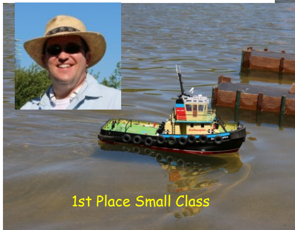
1st Place Small Class