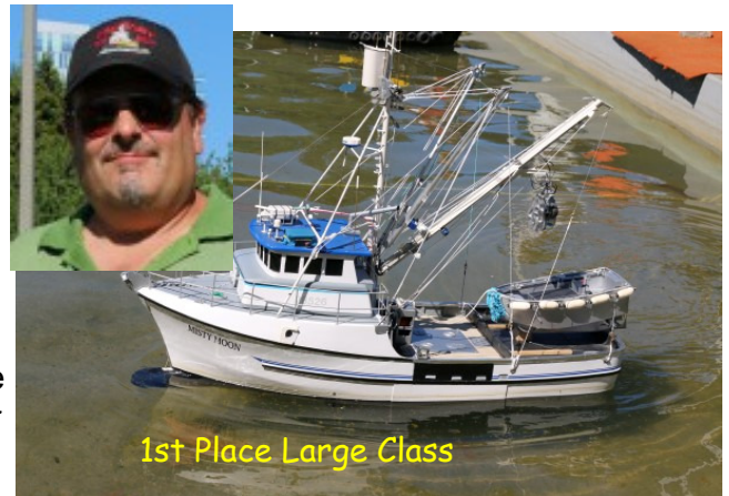
1st Place Large Class

All in all the regatta ran smoothly thanks to the efforts of many and everyone had a fun day which is the most important measure.