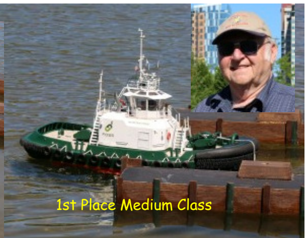
1st Place Medium Class