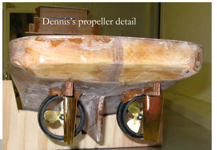
Dennis's propeller detail