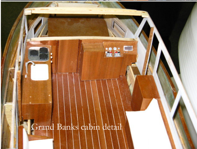
Grand Banks cabin detail