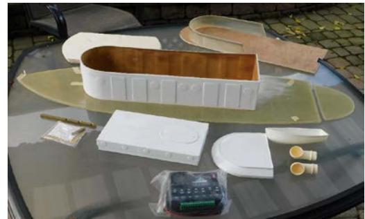
Price: $850.00 (Or Best Offer) The kit is located in Camas, Washington.