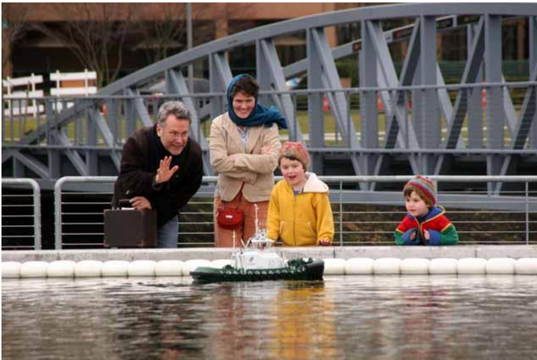
The Excitement of Children can make it warmer