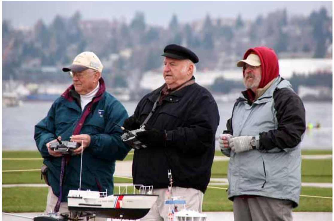
A Cold Day at the Pond