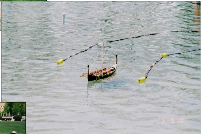
Norm's Viking Ship Practicing