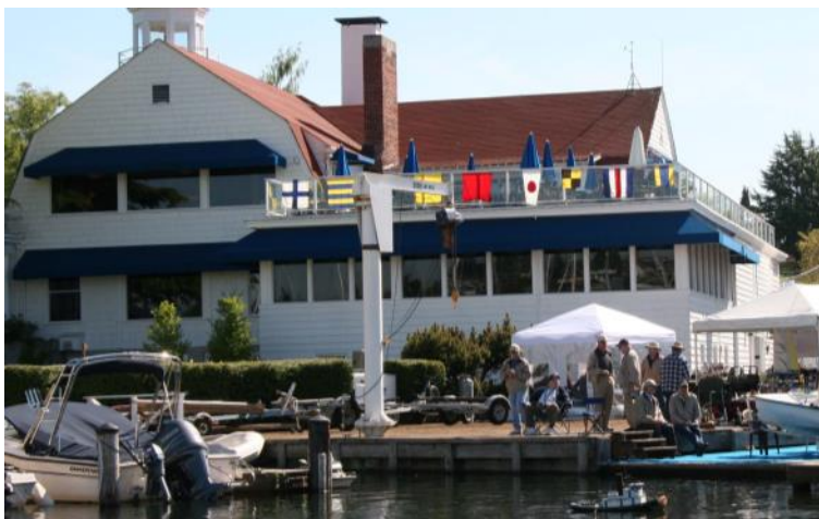
The Central Location of Our Venue