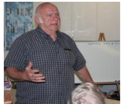
Mel Tells About "Easier" Models