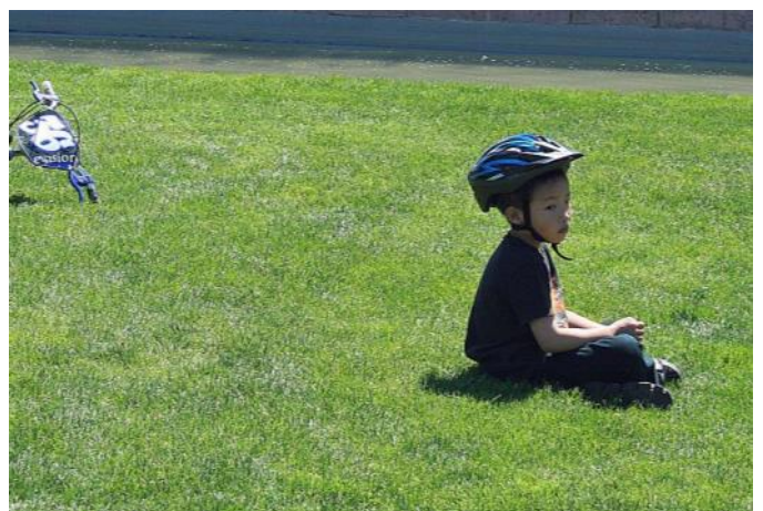
This Young Man Spent Much of the Afternoon in Rapt Awe