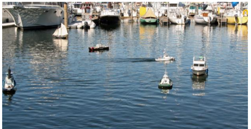
A Collection of Some of the Day's Flotilla