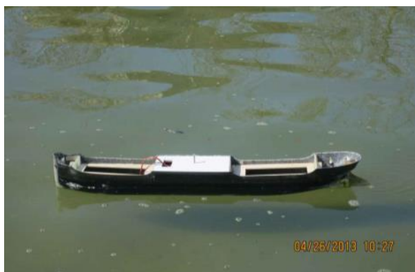
Noel's Freighter Hull Undergoing Tests