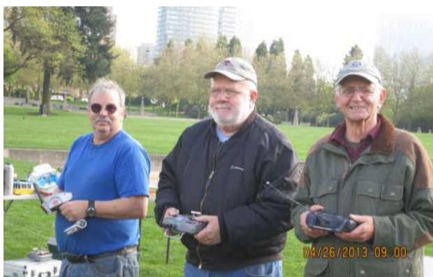
The Three Amigos