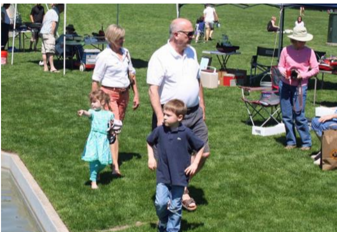
A Family of Spectators each Enjoying Something Different